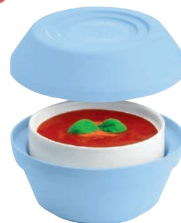
Insulating set for soup bowls