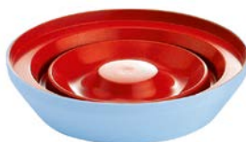
Insulating cover interior