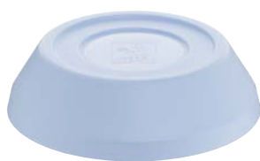
Insulating cover exterior